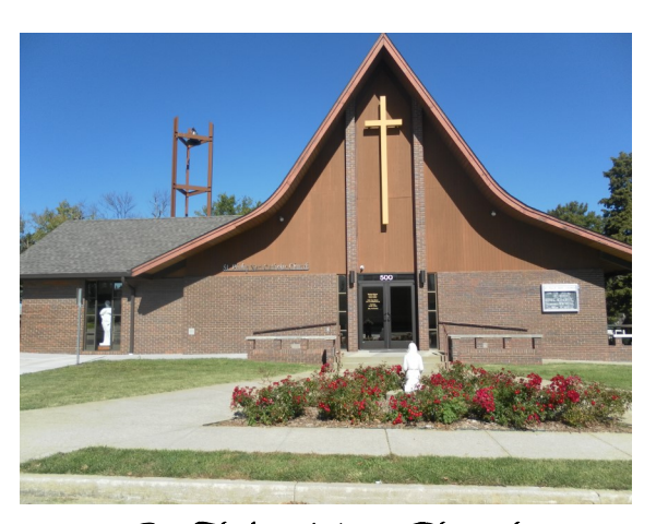
St. Philip Neri Church 514 Parker Ave, Osawatomie, KS 66064 https://www.miamilinncatholics.org/SPN