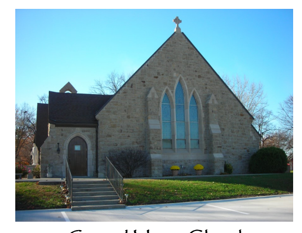
Sacred Heart Church (St. Rose Philippine Duchesne Shrine) 729 W Main St, Mound City, KS 66056 https://www.miamilinncatholics.org/SH