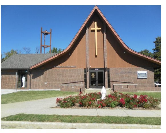
St. Philip Neri Church 514 Parker Ave, Osawatomie, KS 66064 https://www.miamilinncatholics.org/SPN