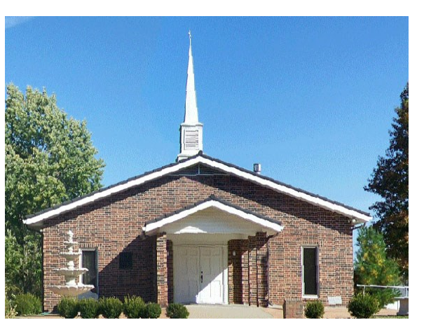
Our Lady of Lourdes Church 819 N 5th St, LaCygne, KS 66040 https://www.miamilinncatholics.org/OLL