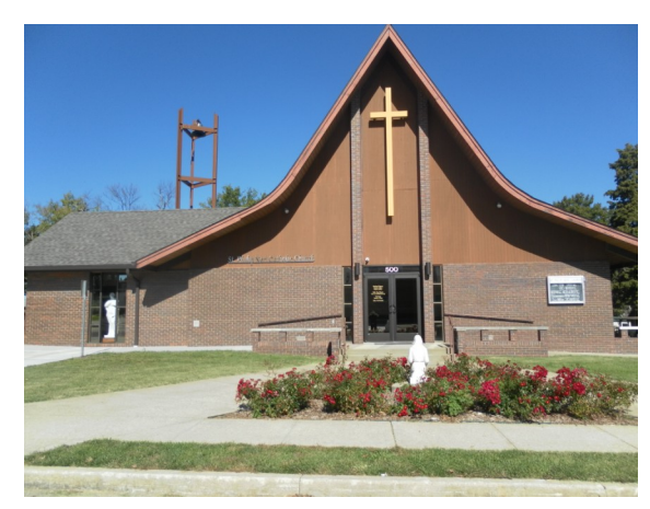
St. Philip Neri Church

514 Parker Ave, Osawatomie, KS 66064 https://www.miamilinncatholics.org/SPN