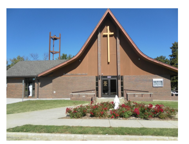
St. Philip Neri Church

514 Parker Ave, Osawatomie, KS 66064 https://www.miamilinncatholics.org/SPN