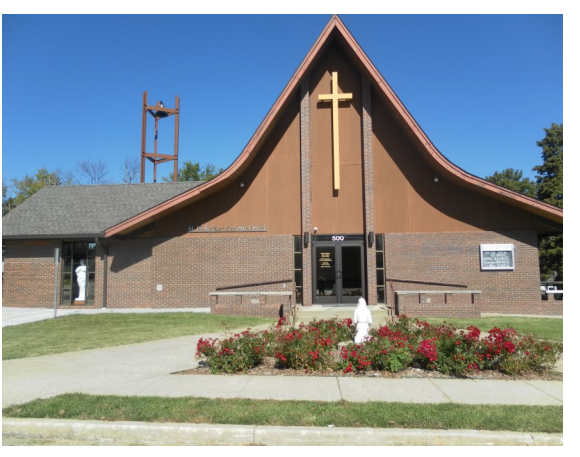
St. Philip Neri Church 514 Parker Ave. Osawatomie, KS 66064 https://www.miamilinncatholics.org/SPN