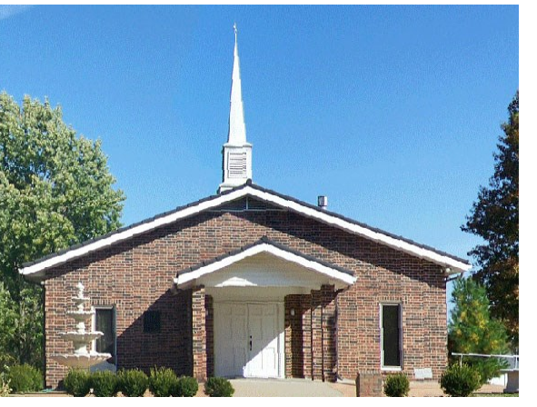
Our Lady of Lourdes Church 819 N 5th St, LaCygne, KS 66040 https://www.miamilinncatholics.org/OLL