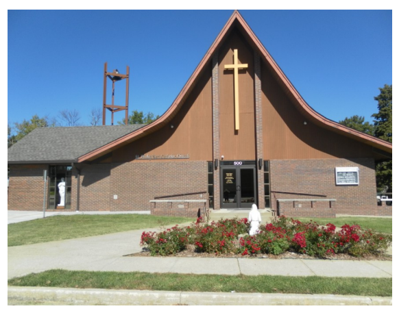
St. Philip Neri Church

514 Parker Ave, Osawatomie, KS 66064 https://www.miamilinncatholics.org/SPN