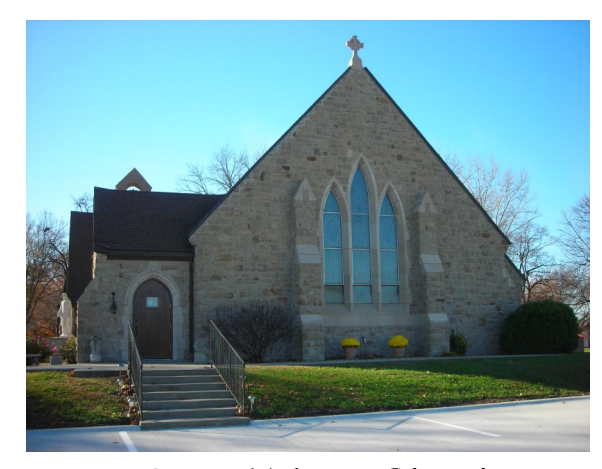
Sacred Heart Church (St. Rose Philippine Duchesne Shrine) 729 W Main St, Mound City, KS 66056