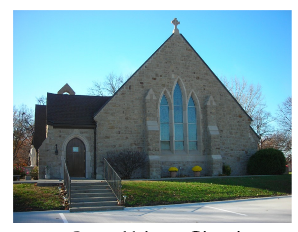
Sacred Heart Church (St. Rose Philippine Duchesne Shrine) 729 W Main St, Mound City, KS 66056