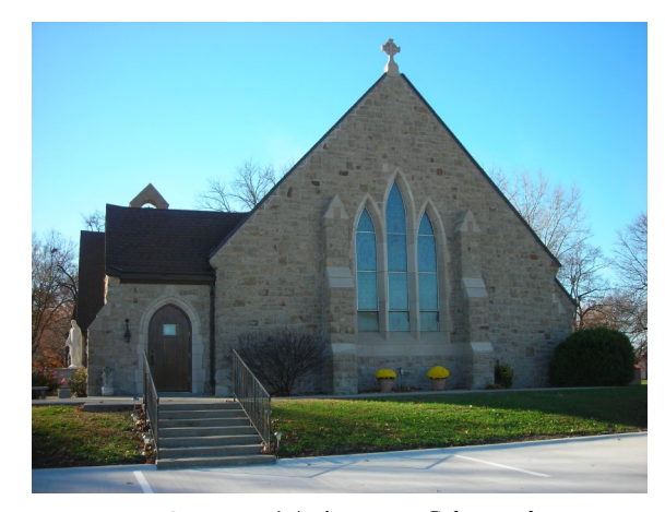
Sacred Heart Church (St. Rose Philippine Duchesne Shrine) 729 W Main St, Mound City, KS 66056