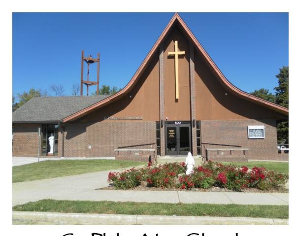
St. Philip Neri Church 514 Parker Ave, Osawatomie, KS 66064 https://www.miamilinncatholics.org/SPN