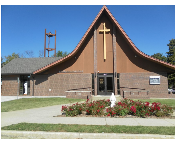
St. Philip Neri Church 514 Parker Ave, Osawatomie, KS 66064 https://www.miamilinncatholics.org/SPN