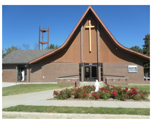
St. Philip Neri Church 514 Parker Ave, Osawatomie, KS 66064 https://www.miamilinncatholics.org/SPN