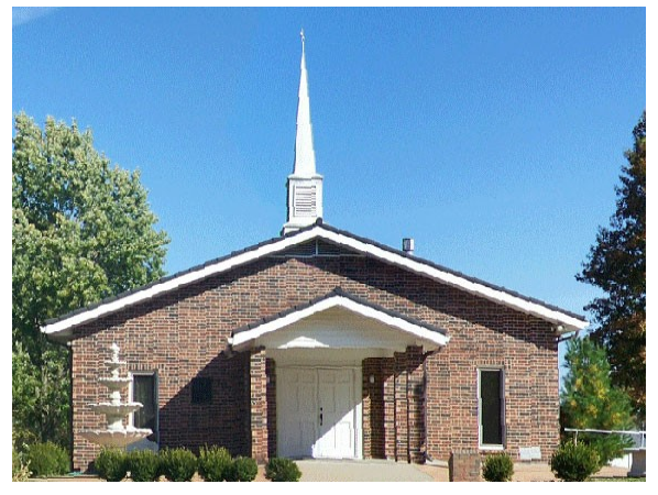
Our Lady of Lourdes Church 819 N 5th St, LaCygne, KS 66040 https://www.miamilinncatholics.org/OLL