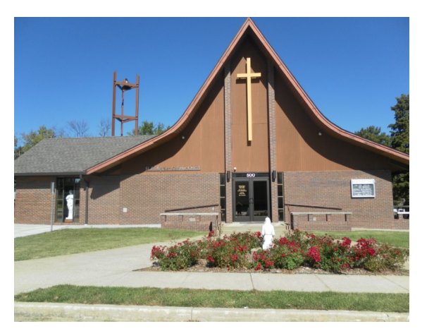
St. Philip Neri Church

514 Parker Ave, Osawatomie, KS 66064 https://www.miamilinncatholics.org/SPN