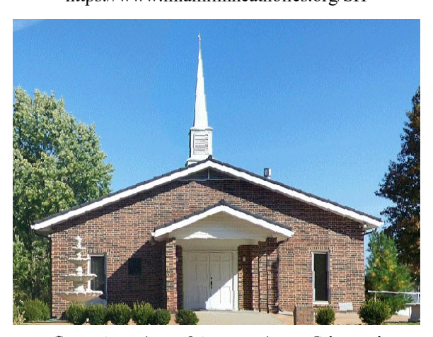
Our Lady of Lourdes Church

729 W Main St, Mound City, KS 66056 https://www.miamilinncatholics.org/SH