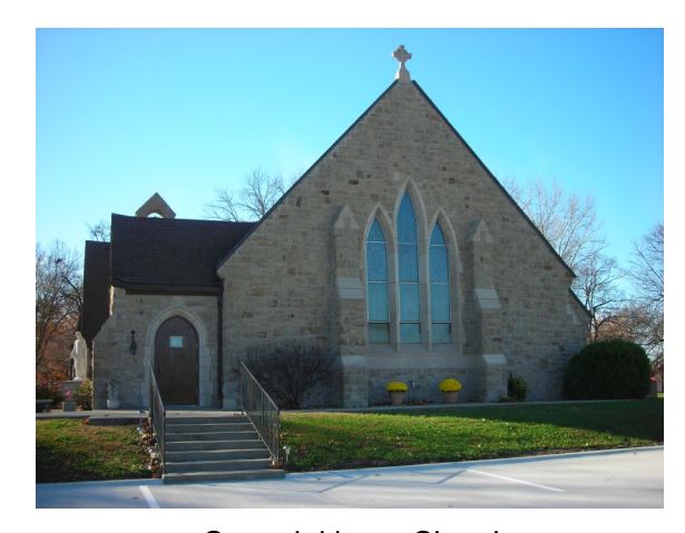
Sacred Heart Church (St. Rose Philippine Duchesne Shrine) 729 W Main St, Mound City, KS 66056 https://www.miamilinncatholics.org/SH