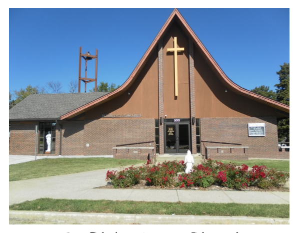
St. Philip Neri Church 514 Parker Ave, Osawatomie, KS 66064 https://www.miamilinncatholics.org/SPN