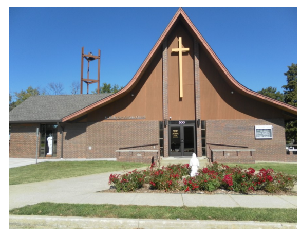
St. Philip Neri Church

514 Parker Ave, Osawatomie, KS 66064 https://www.miamilinncatholics.org/SPN