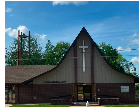
St. Philip Neri Church 514 Parker Ave, Osawatomie, KS 66064 https://www.miamilinn Catholics.org/SPN