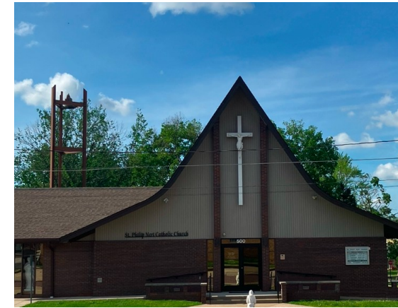
St. Philip Neri Church 514 Parker Ave, Osawatomie, KS 66064 https://www.miamilinn Catholics.org/SPN