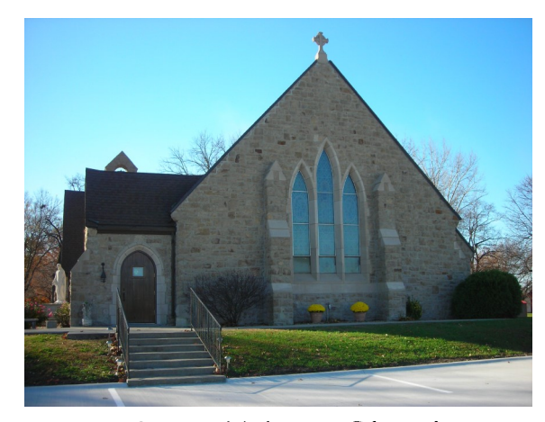
Sacred Heart Church (St. Rose Philippine Duchesne Shrine) 729 W Main St, Mound City, KS 66056