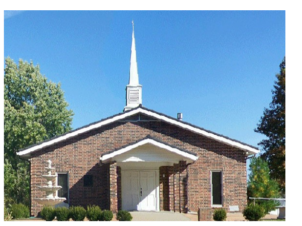
Our Lady of Lourdes Church 819 N 5th St, LaCygne, KS 66040 https://www.miamilinncatholics.org/OLL