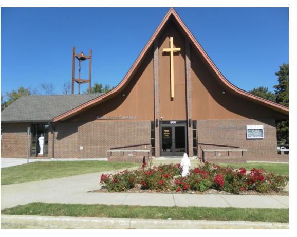
St. Philip Neri Church 514 Parker Ave. Osawatomie, KS 66064 https://www.miamilinncatholics.org/SPN