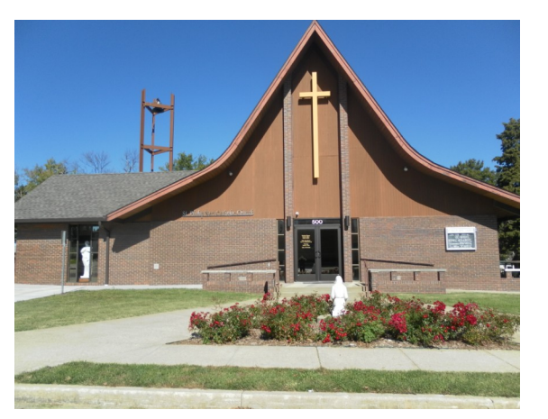
St. Philip Neri Church

514 Parker Ave, Osawatomie, KS 66064 https://www.miamilinncatholics.org/SPN