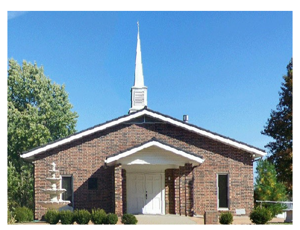
Our Lady of Lourdes Church 819 N 5th St. LaCvane, KS 66040 https://www.miamilinncatholics.org/OLL