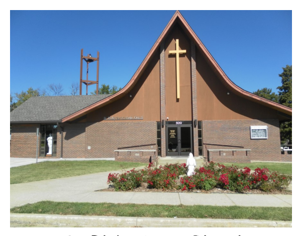
St. Philip Neri Church 514 Parker Ave. Osawatomie, KS 66064 https://www.miamilinncatholics.org/SPN