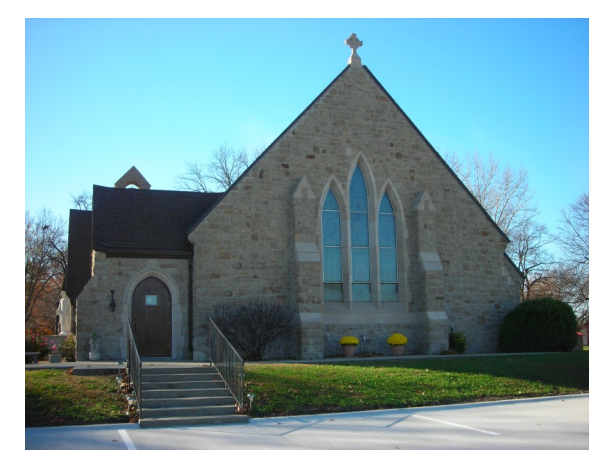
Sacred Heart Church (St. Rose Philippine Duchesne Shrine) 729 W Main St, Mound City, KS 66056