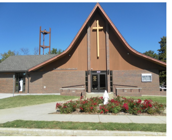
St. Philip Neri Church

For Ads: J.S. Paluch Co., Inc. 1-800-945-6629