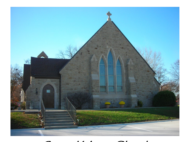
Sacred Heart Church (St. Rose Philippine Duchesne Shrine) 729 W Main St, Mound City, KS 66056 https://www.miamilinncatholics.org/SH