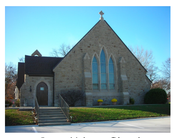
Sacred Heart Church (St. Rose Philippine Duchesne Shrine) 729 W Main St, Mound City, KS 66056