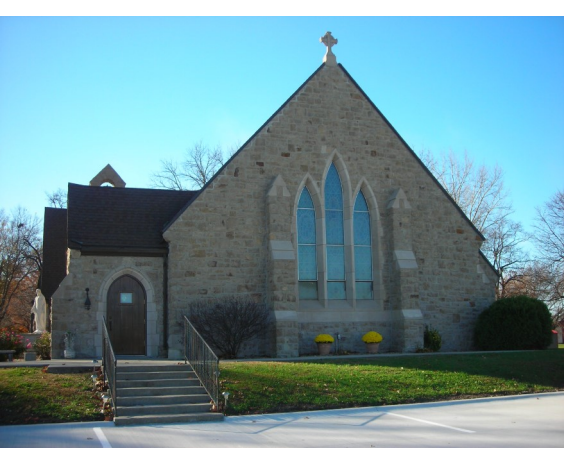
Sacred Heart Church (St. Rose Philippine Duchesne Shrine) 729 W Main St, Mound City, KS 66056 https://www.miamilinncatholics.org/SH