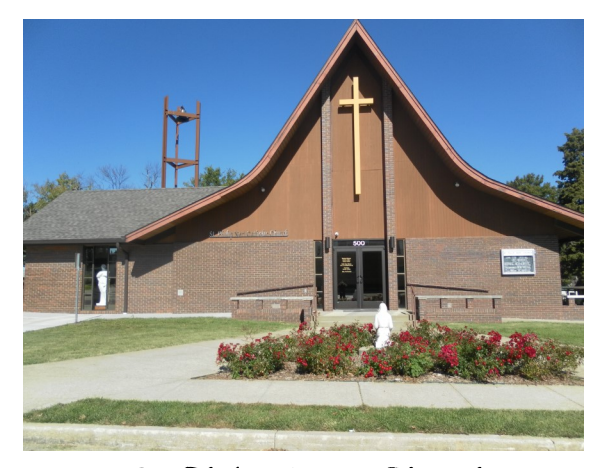
St. Philip Neri Church 514 Parker Ave, Osawatomie, KS 66064 https://www.miamilinncatholics.org/SPN