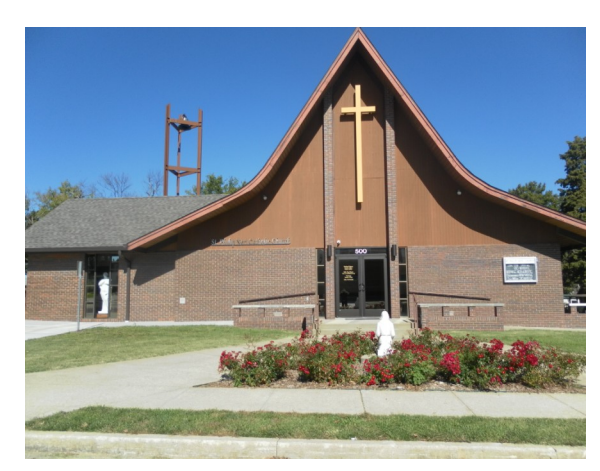
St. Philip Neri Church

514 Parker Ave, Osawatomie, KS 66064 https://www.miamilinncatholics.org/SPN