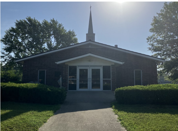
Our Lady of Lourdes Church 819 N 5th St, LaCygne, KS 66040 https://www.miamilinnccatholics.org/OLL