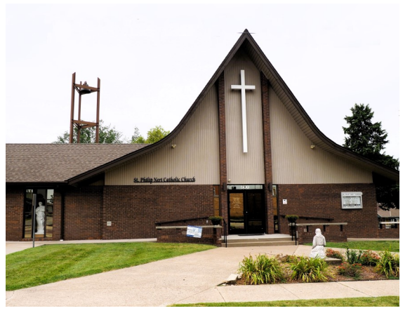
St. Phílíp Nerí Church 514 Parker Ave, Osawatomie, KS 66064 https://www.miamilinncatholics.org/SPN