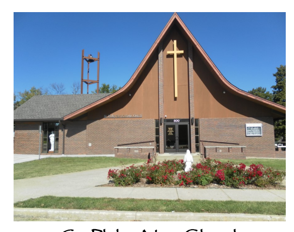
St. Philip Neri Church 514 Parker Ave, Osawatomie, KS 66064 https://www.miamilinncatholics.org/SPN