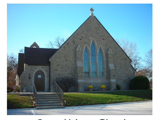
Sacred Heart Church (St. Rose Philippine Duchesne Shrine) 729 W Main St, Mound City, KS 66056