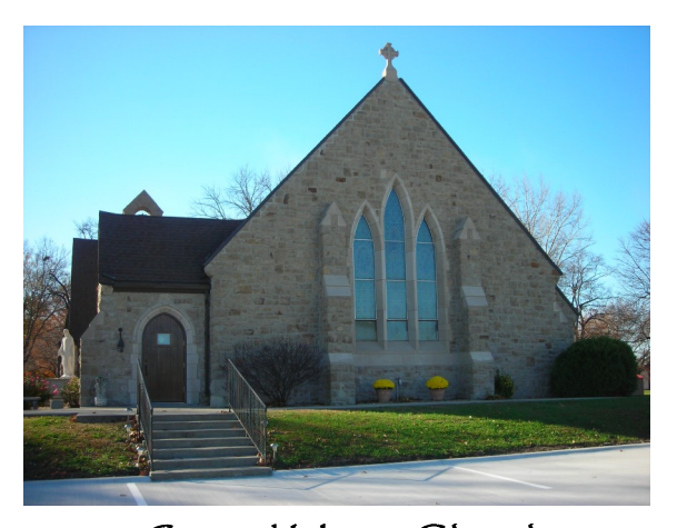
Sacred Heart Church (St. Rose Philippine Duchesne Shrine) 729 W Main St, Mound City, KS 66056 https://www.miamilinncatholics.org/SH