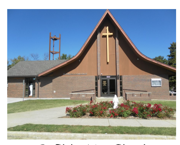
St. Philip Neri Church 514 Parker Ave, Osawatomie, KS 66064 https://www.miamilinncatholics.org/SPN