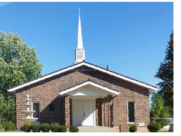
Our Lady of Lourdes Church 819 N 5th St, LaCygne, KS 66040 https://www.miamilinncatholics.org/OLL