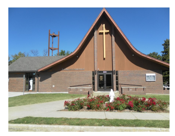
St. Philip Neri Church 514 Parker Ave, Osawatomie, KS 66064 https://www.miamilinncatholics.org/SPN