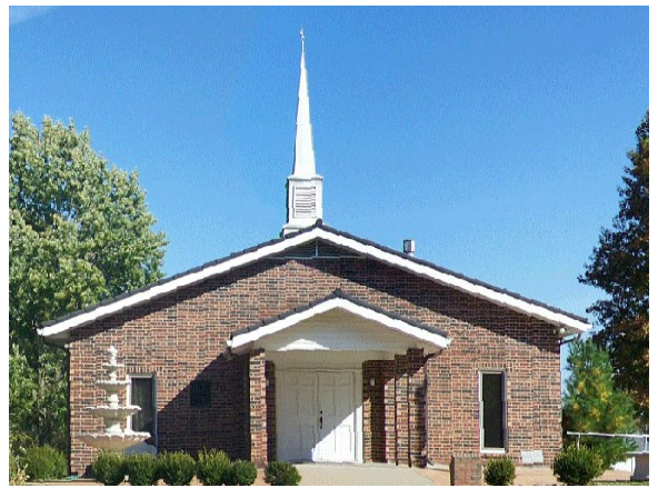
Our Lady of Lourdes Church 819 N 5th St, LaCygne, KS 66040 https://www.miamilinncatholics.org/OLL