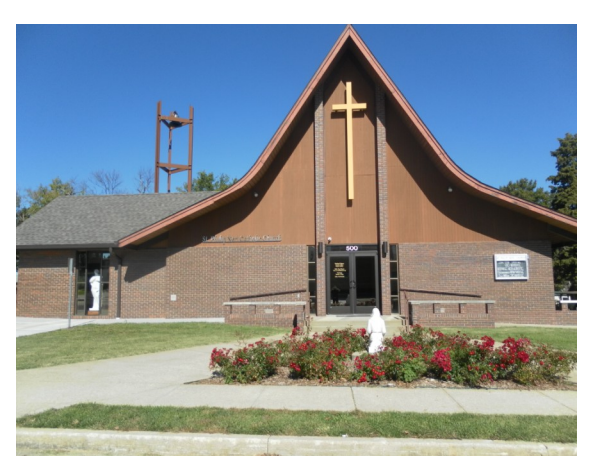
St. Philip Neri Church

514 Parker Ave, Osawatomie, KS 66064 https://www.miamilinncatholics.org/SPN