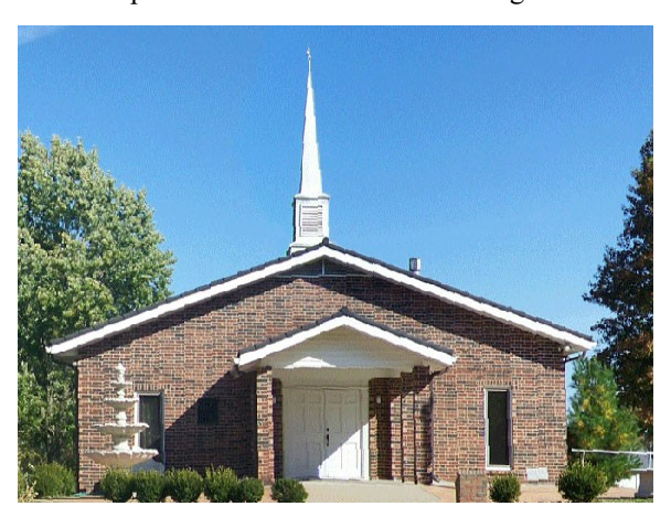
Our Lady of Lourdes Church

729 W Main St, Mound City, KS 66056 https://www.miamilinncatholics.org/SH