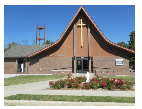
St. Philip Neri Church

514 Parker Ave, Osawatomie, KS 66064 https://www.miamilinncatholics.org/SPN