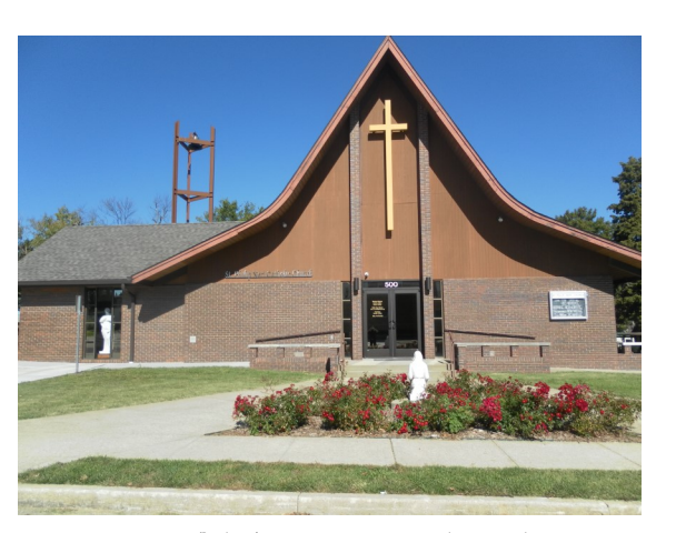
St. Philip Neri Church 514 Parker Ave, Osawatomie, KS 66064 https://www.miamilinncatholics.org/SPN