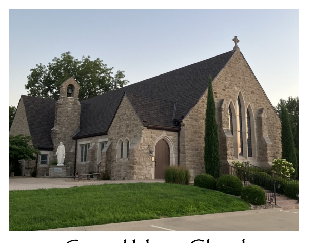
Sacred Heart Church (St. Rose Philippine Duchesne Shrine) 729 W Main St, Mound City, KS 66056 https://www.miamilinncatholics.org/SH