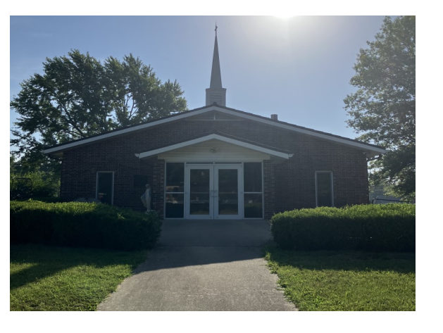
Our Lady of Lourdes Church 819 N 5th St, LaCygne, KS 66040 https://www.miamilinncatholics.org/OLL