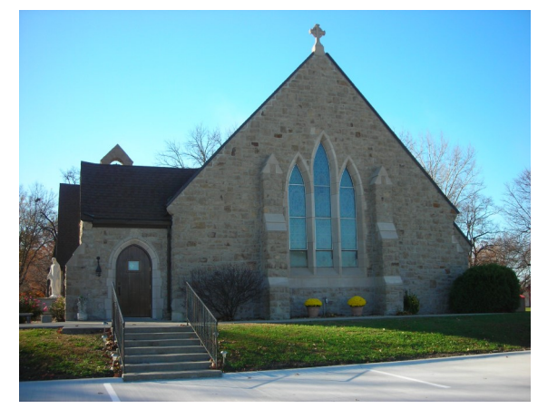
Sacred Heart Church

(St. Rose Philippine Duchesne Shrine) 729 W Main St, Mound City, KS 66056 https://www.miamilinncatholics.org/SH