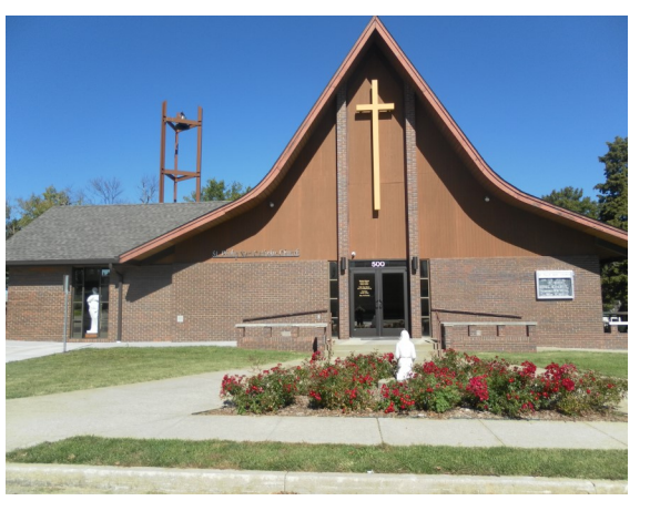
St. Philip Neri Church 514 Parker Ave. Osawatomie, KS 66064 https://www.miamilinncatholics.org/SPN