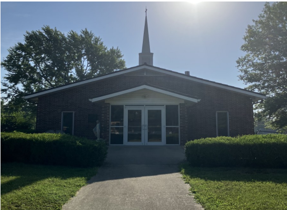
Our Lady of Lourdes Church 819 N 5th St, LaCygne, KS 66040 https://www.miamilinnccatholics.org/OLL