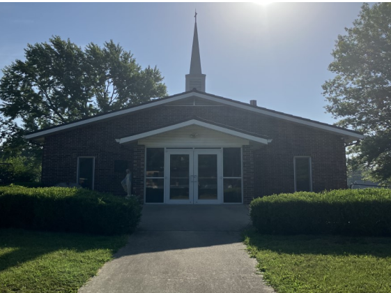
Our Lady of Lourdes Church 819 N 5th St, LaCygne, KS 66040 https://www.miamilinncatholics.org/OLL

Sacred Heart Church (St. Rose Philippine Duchesne Shrine) 729 W Main St, Mound City, KS 66056 https://www.miamilinncatholics.org/SH