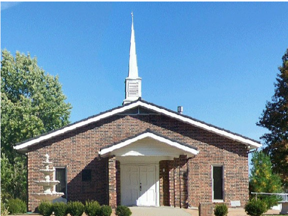
Our Lady of Lourdes Church 819 N 5th St, LaCygne, KS 66040 https://www.miamilinn Catholics.org/OLL