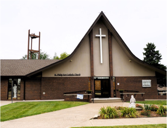
St. Philip Neri Church 514 Parker Ave, Osawatomie, KS 66064 https://www.miamilinn Catholics.org/SPN