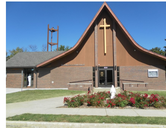
St. Philip Neri Church

St. Philip Neri: 9:30 –10:30am Sundays Sacred Heart: 5:00 - 6:15pm Saturdays O. L. of Lourdes: 9:30 - 10:30am Sundays