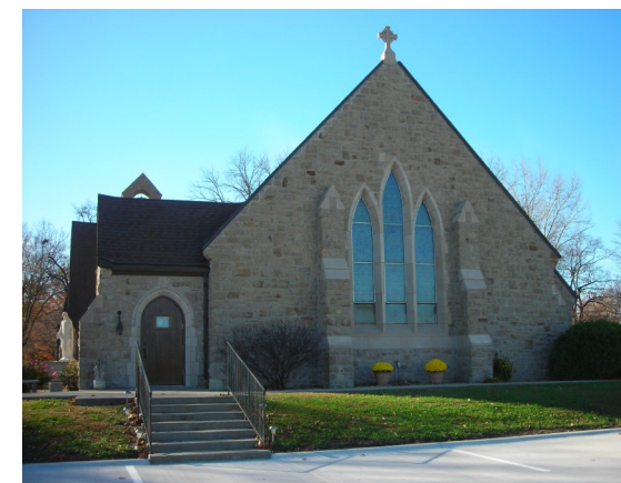
Sacred Heart Church

514 Parker Ave, Osawatomie, KS 66064 https://www.miamilinn Catholics.org/SPN