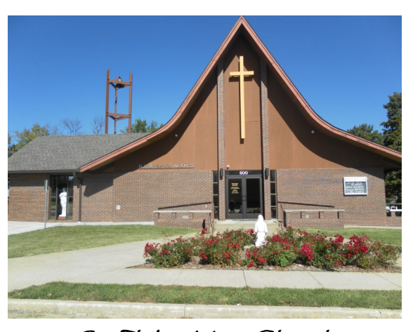
St. Philip Neri Church 514 Parker Ave, Osawatomie, KS 66064 https://www.miamilinncatholics.org/SPN