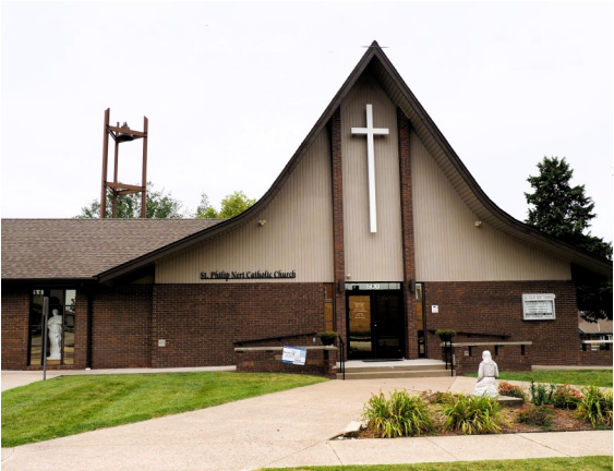
St. Philip Neri Church 514 Parker Ave, Osawatomie, KS 66064 https://www.miamilinnccatholics.org/SPN