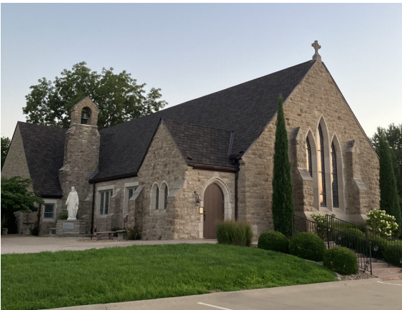
Sacred Heart Church (St. Rose Philippine Duchesne Shrine) 729 W Main St, Mound City, KS 66056 https://www.miamilinnccatholics.org/SH