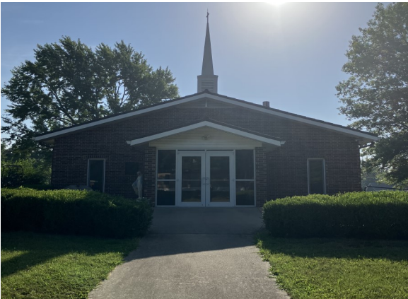
Our Lady of Lourdes Church 819 N 5th St, LaCygne, KS 66040 https://www.miamilinnccatholics.org/OLL