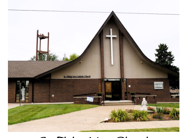
St. Philip Neri Church 514 Parker Ave, Osawatomie, KS 66064 https://www.miamilinncatholics.org/SPN