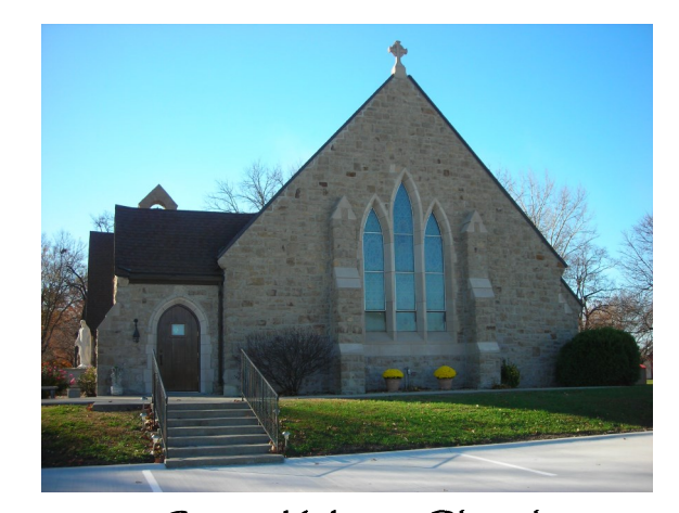
Sacred Heart Church (St. Rose Philippine Duchesne Shrine) 729 W Main St, Mound City, KS 66056 https://www.miamilinncatholics.org/SH