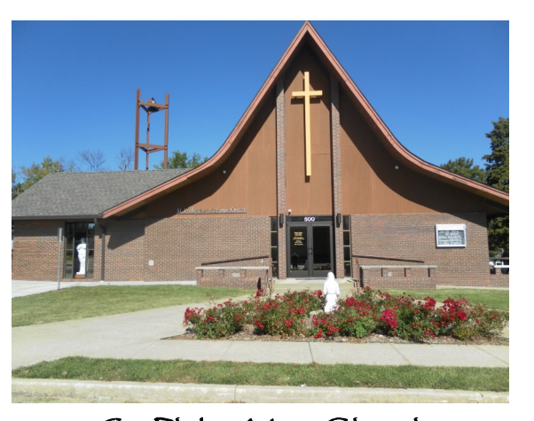
St. Philip Neri Church 514 Parker Ave, Osawatomie, KS 66064 https://www.miamilinncatholics.org/SPN