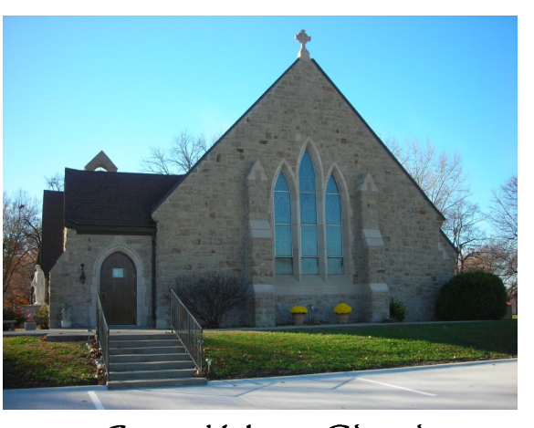
Sacred Heart Church (St. Rose Philippine Duchesne Shrine) 729 W Main St, Mound City, KS 66056 https://www.miamilinncatholics.org/SH